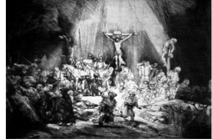
Rembrandt's portrayal of the Crucifixion (unfinished)

All the gospels, using different details, describe the final days of Jesus' life. One example to which you could turn is Luke 19 – 23 where these chapters describe the last week of Jesus' life where He rode into Jerusalem on a donkey to the praise of the people (Palm Sunday) and then later that week, He celebrated the Passover with His disciples, instituted Holy Communion, went to the Mount of Olives for prayer where He was betrayed by Judas, arrested by the Romans and taken to a mock trial with Pilate, then Herod, and then Pilate again. The crucifixion took place followed by His death and burial.